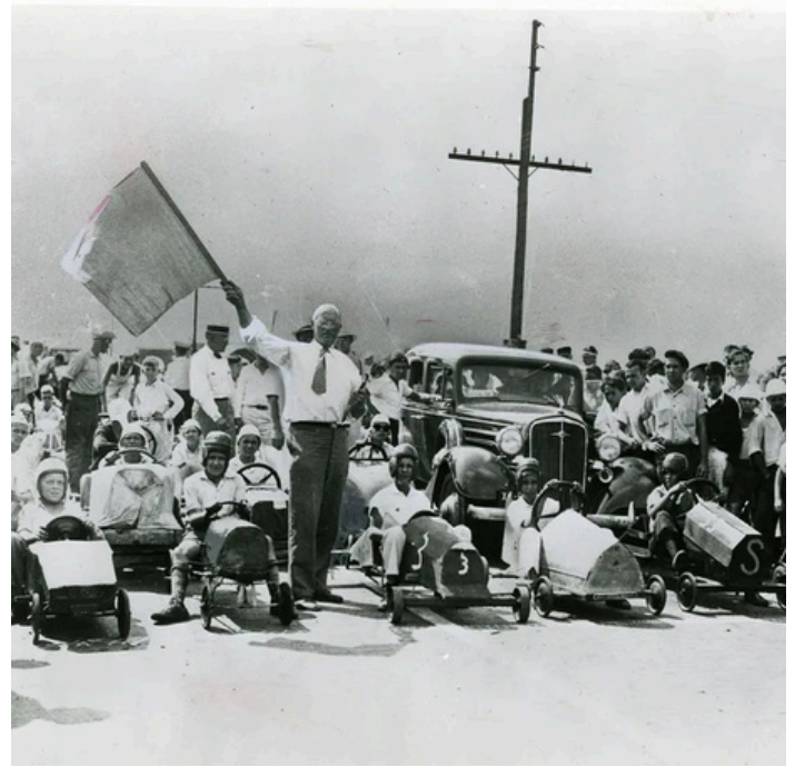
A Tradition is Born - The start of the first Soap Box Derby in Dayton, Ohio in 1934.